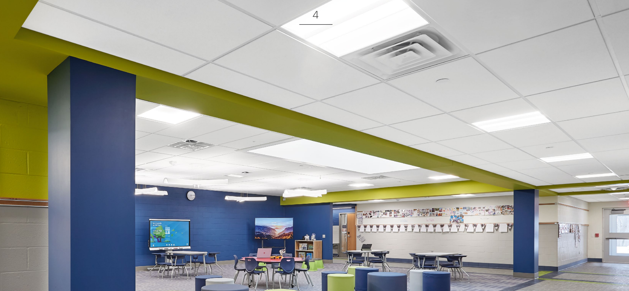
Ultima® Ceiling Panels with Prelude® 15/16" Suspension System