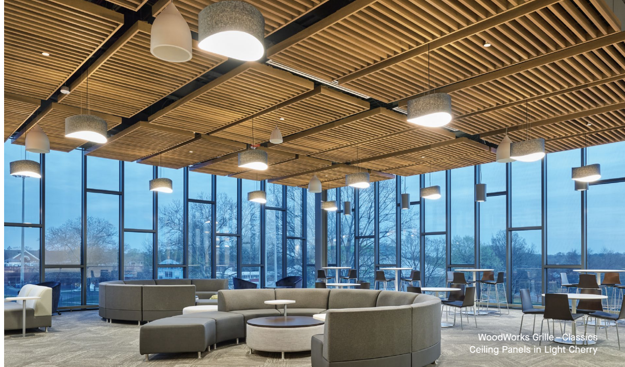
WoodWorks Grille – Classics Ceiling Panels in Light Cherry