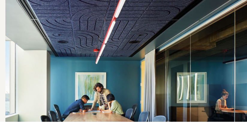
Tectum® DesignArt™ – Lines Tegular ceiling panels in Twilight Cover photo: Lyra® PB ceiling panels in Toffee Chestnut