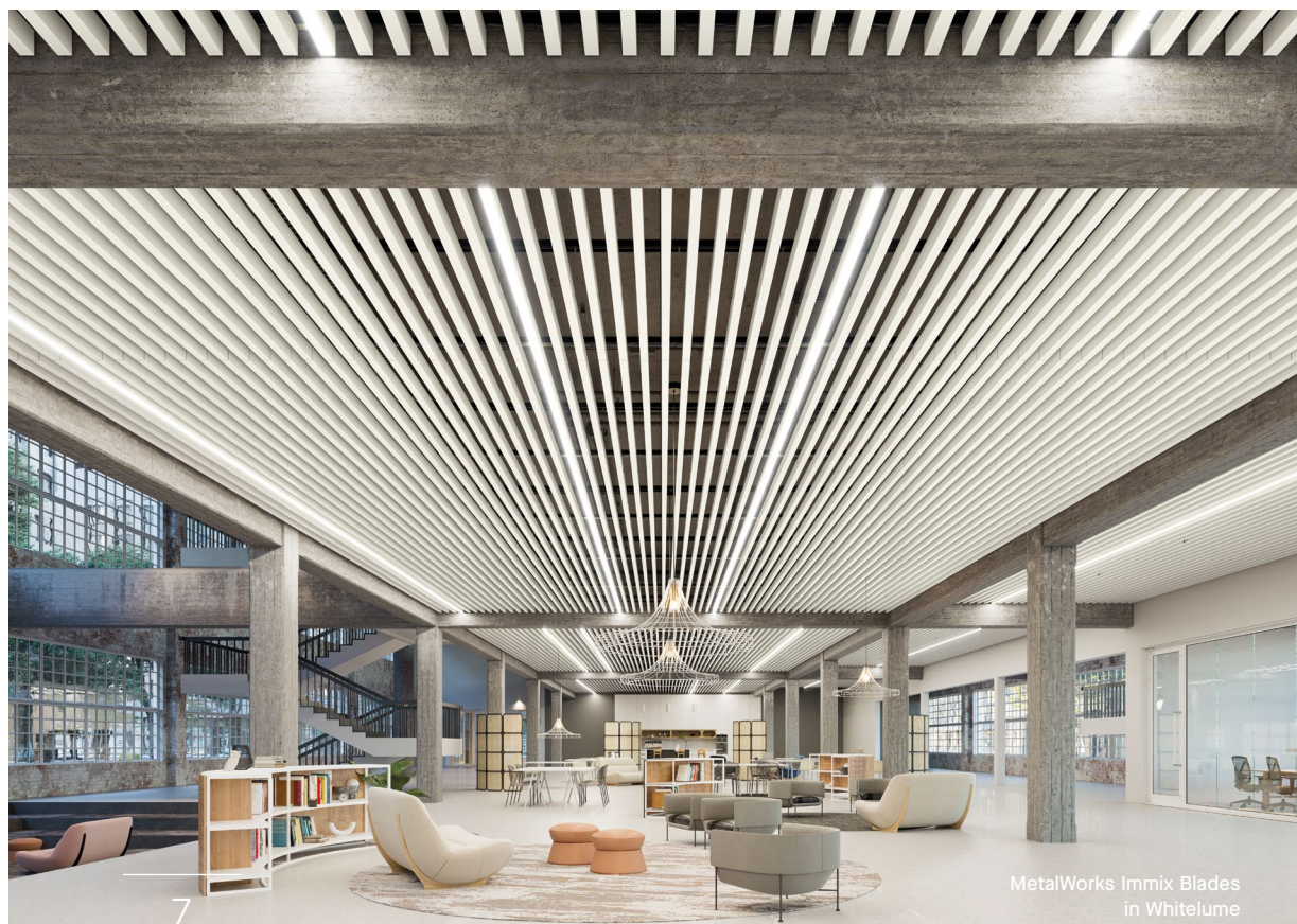
MetalWorks Immix Blades in Whitelume