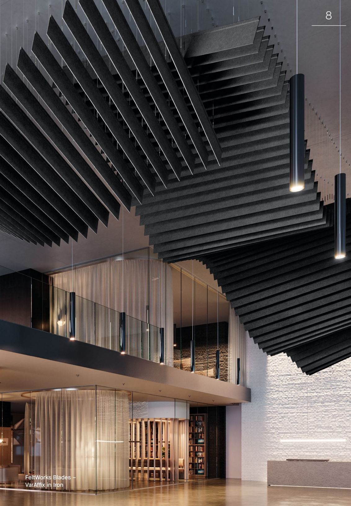
FeltWorks Blades – VarAffix in Iron