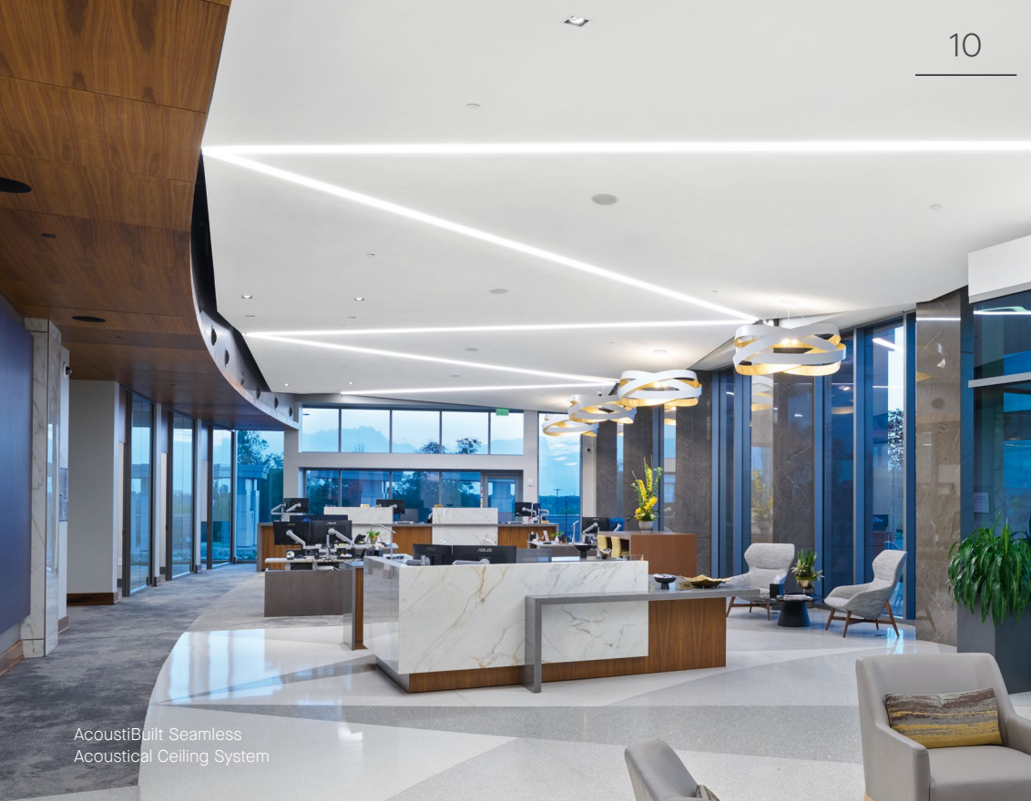
AcoustiBuilt Seamless Acoustical Ceiling System