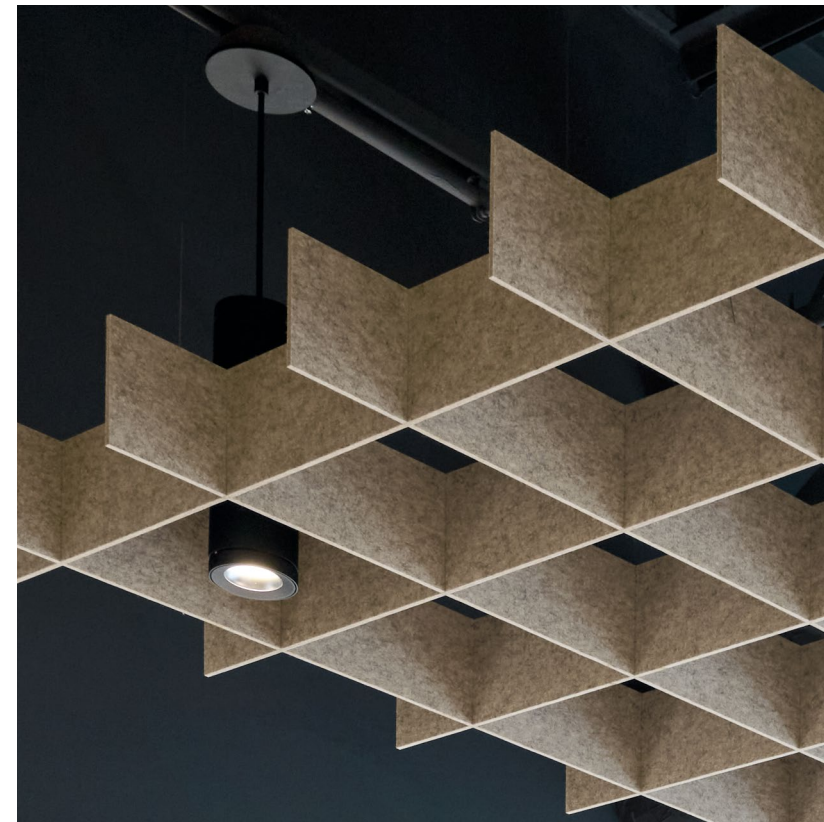
FeltWorks Open Cell in Mocha